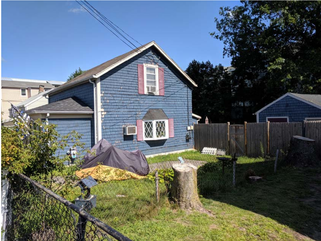
15 Woodbine Street